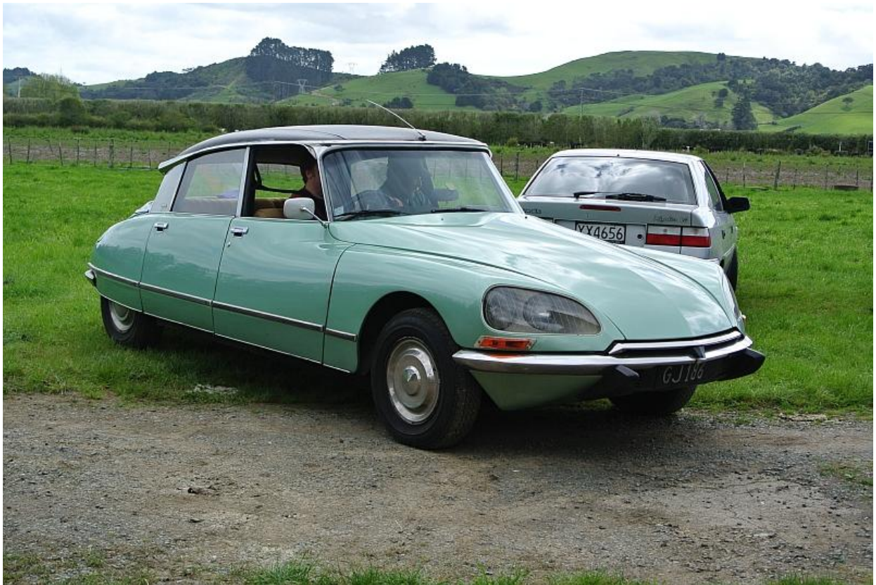
All done and off for a test run.