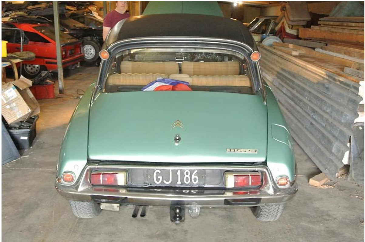
Vince arrives at the shed with lots of goodies